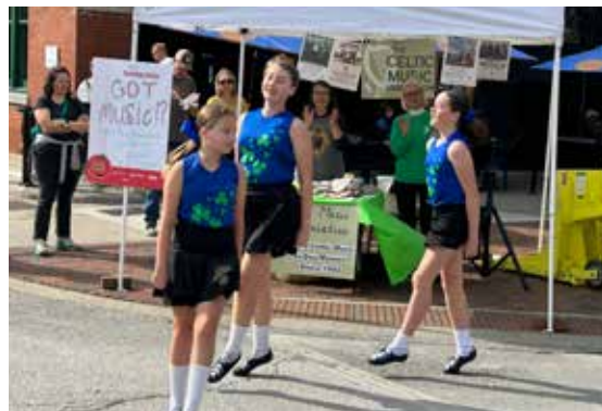
Foy dancers perform at the downtown farmers market where the CMA had a stand to inform people about our concerts. They will perform at the Tallymore concert.