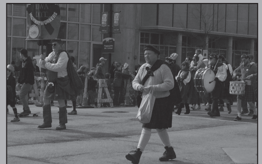
St. Patrick's Day parade March 17, 2016.

St. Patrick's day lands on a Friday, March 17th this year. Join us at noon for the annual parade. Same route as last year.