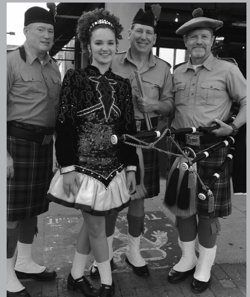
Foy Irish dancers perform with the Celtic Music Association at the downtown farmer's market in September.