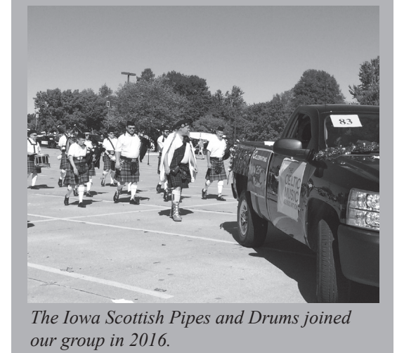
The Iowa Scottish Pipes and Drums joined our group in 2016.