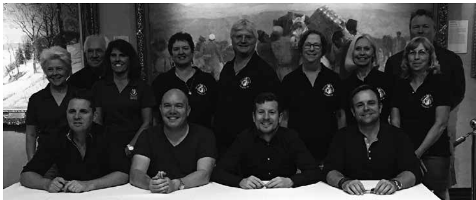
The High Kings, with CMA board members, after the August 2 concert.